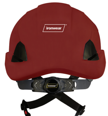
(Back with Ratchet)