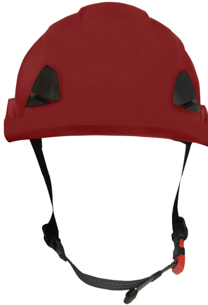
(Front with Chin Strap)